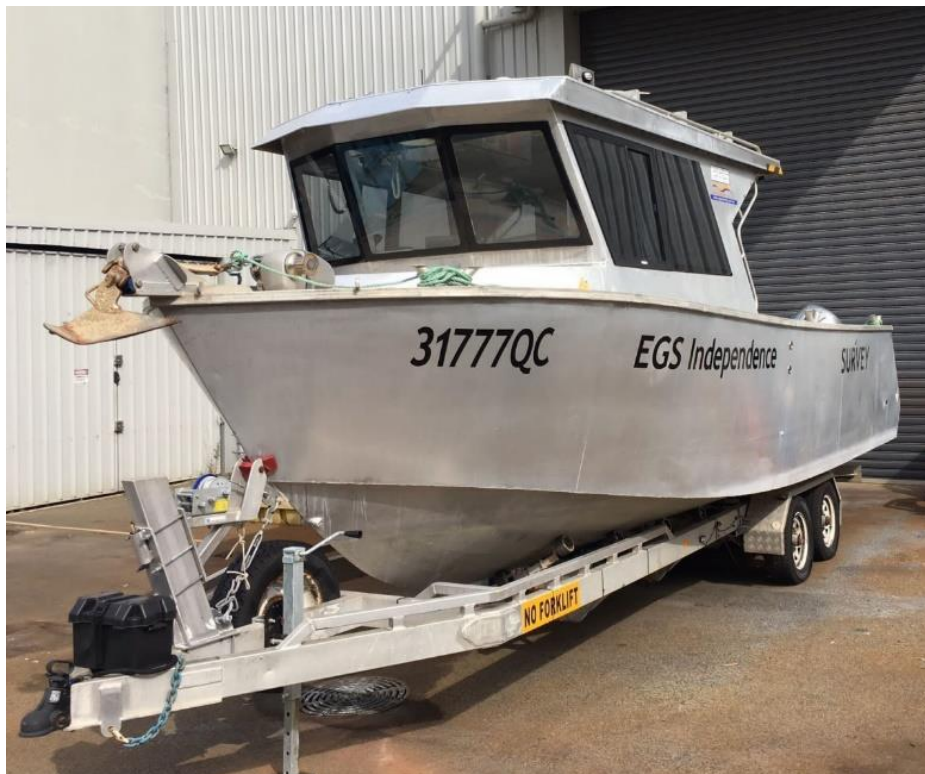
Hydrographic Survey and Support Vessel “Independence”