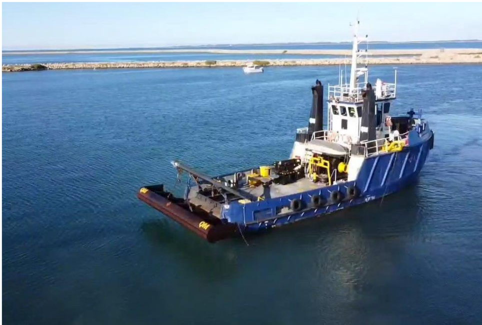
Dredge Vessel "Reliance"